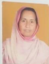
सखी देवी सासक